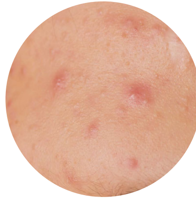
Papules & pustules